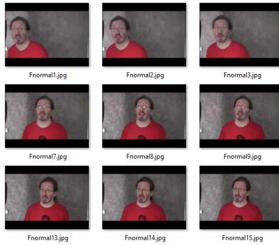
Figure 2. Ordinary Camera Frames