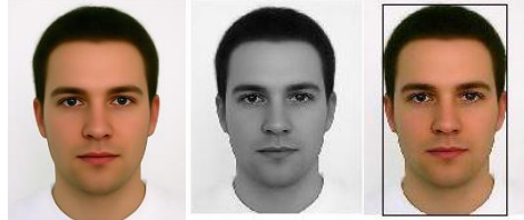
Figure 6. Facial recognition

Object detection technique can be employed in real life scenarios in this we have applied facial recognition system which will be effective in identifying personals in a crowdie scenarios as shown in figure 6. It is implemented with k-NN algorithm for training the feature points from the input data. During the testing phase, it validates with the source and target information. The confusion matrix is the required term for classification procedure; from this parameter the performance metrics are computed.