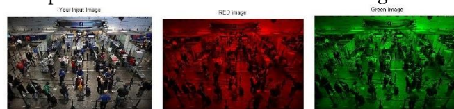
Figure 5. Different threshold level analysis

Segmentation algorithm is applied in different scenarios in this we see the results of different levels of threshold of an airport surveillance scenario as shown in figure 5.