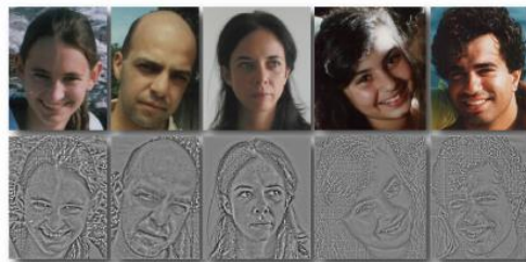
Figure 4. Pre-processing of the source image

The technique is used to filter the unwanted frequency component from the original image which gives a better quality of the image. It is widely used in the effects of the graphical data, to reduce the image noise and dimensionality of the input information.